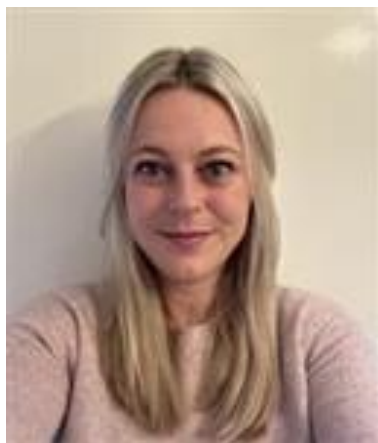
Miss Proud Admin Assistant