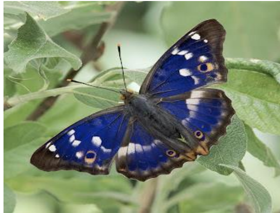
Emperor Class Mrs Palmer